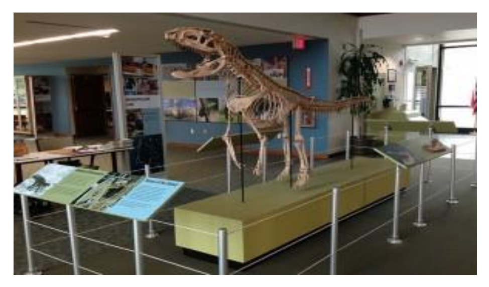
Pictured: Exhibit in North Carolina Museum of Natural Sciences at Whiteville

Pictured: Exterior of North Carolina Museum of Natural Sciences at Whiteville