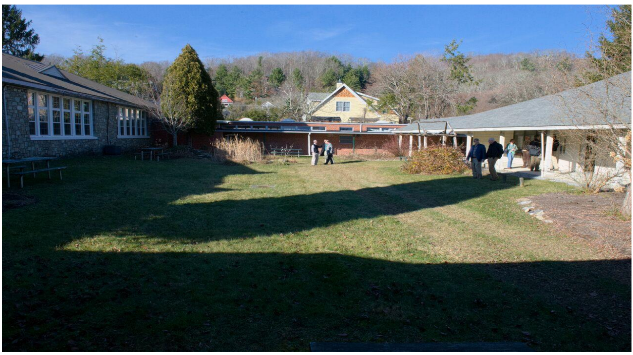
Pictured: Rear courtyard.